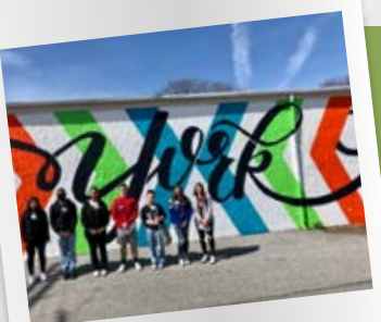
Future Leaders of York