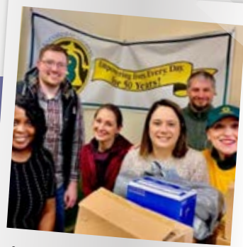
Leadership Training Program