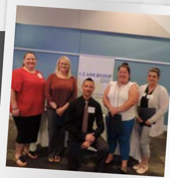
Leadership for Diverse Schools